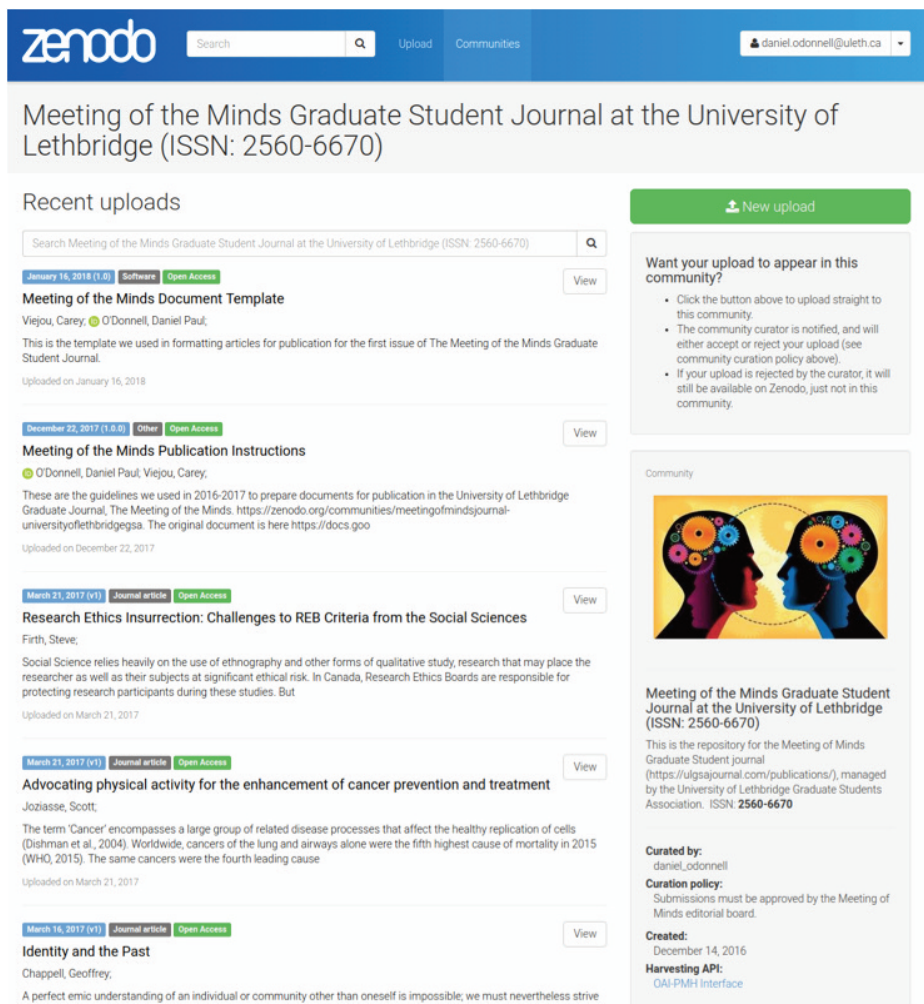
Figure 4: The front page of the Meeting of the Minds Zenodo Community

The second dissemination route is via a free Wordpress site hosted by Wordpress.com (Graduate Student Association [University of Lethbridge], 2017a) (see Figure 5).