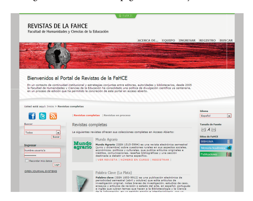
Figure 1: View of the homepage of the FaHCE journal site

As the columns of the homepage were being developed, we realized that the design needed a left column and that the system had not originally offered that possibility.<sup>12</sup> As a result, the components of the current design had to be developed as TPL (Smarty) templates in order for them to be applied to the Homepage. This required a script programming that could determine whether a user was surfing the site "Home" or the journals, and which eliminated the templates developed for the homepage when the user was surfing the journals. This prevented duplication since the homepage components were placed directly on the source code.