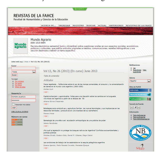
Figure 2: Example of the view of a journal in the FaHCE journal site: Mundo Agrario

The central column of the content section of the main view of each journal was also modified to achieve the required design: the order of information predetermined in OJS installation was altered and the month and year of publication as well as the volume and number were added to complete the necessary information to facilitate issue identification.