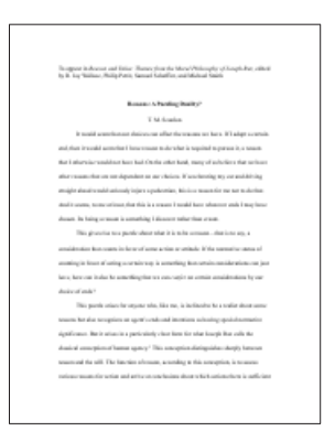
Figure 2: Sample low-resolution images of the first pages of two AMs