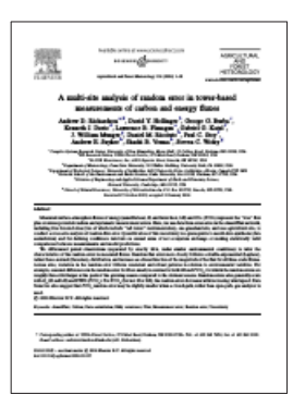
Figure 1: Sample low-resolution images of the first pages of two VoRs

Figures 1 and 2 present sample VoR and AM images. Notice that the two VoRs shown have lower (darker) average pixel values, lower cut-off values, higher colour fractions, higher longest dark rows, and higher longest central light columns.