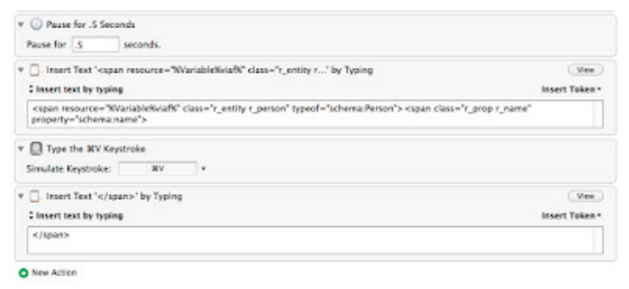
Figure 2: Macro that creates an RDFa attribute connecting the named entity to a VIAF record